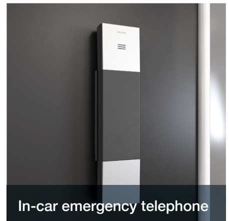
In-car emergency telephone