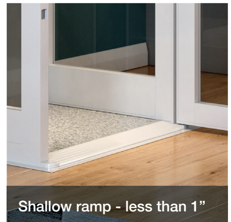
Shallow ramp - less than 1"