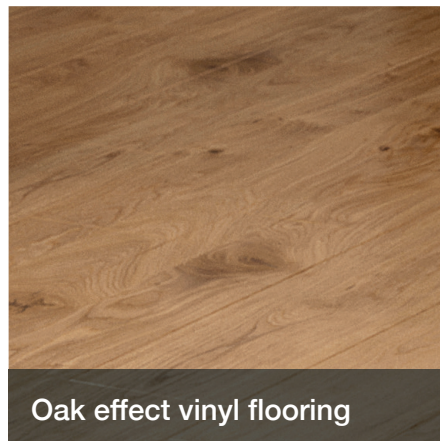
Oak effect vinyl flooring