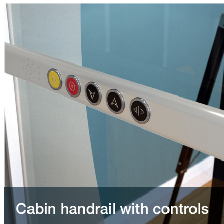
Cabin handrail with controls