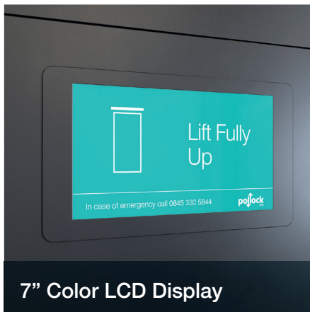
7" Color LCD Display